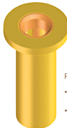
PCB SOLDER SOCKET CONTACT